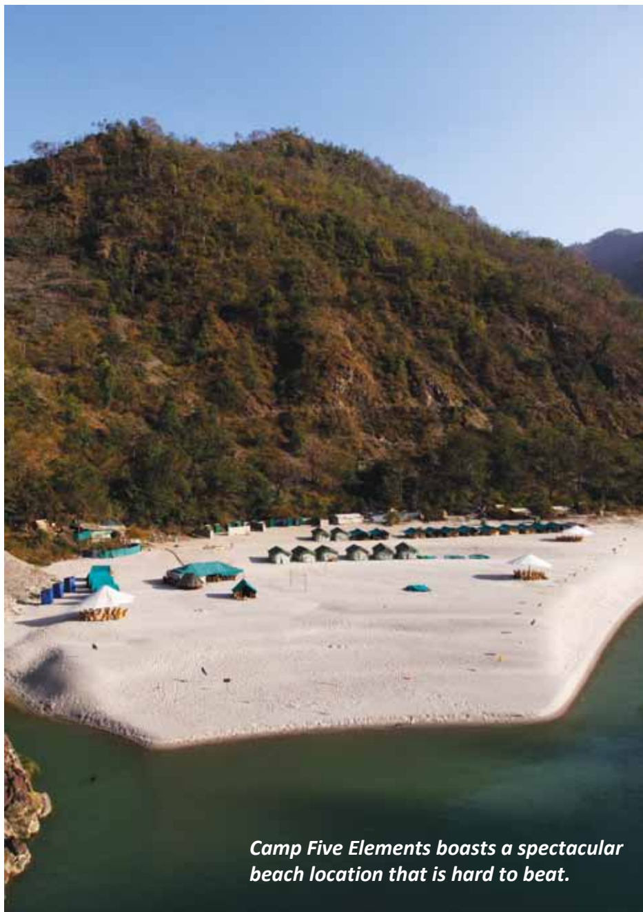
Camp Five Elements boasts a spectacular beach location that is hard to beat.

our wetsuits, collected our paddles and safety equipment, and drove upstream to Kaudiyala where we began our thrilling descent of a fun-filled 36 km section of the mighty Ganga. Rory and I turned out to be the only adventurous suckers to volunteer for Ducky duty that day, so we manned the lone inflatable kayak accompanying an Aquaterra Adventures rafting expedition. But, with an experienced river-running